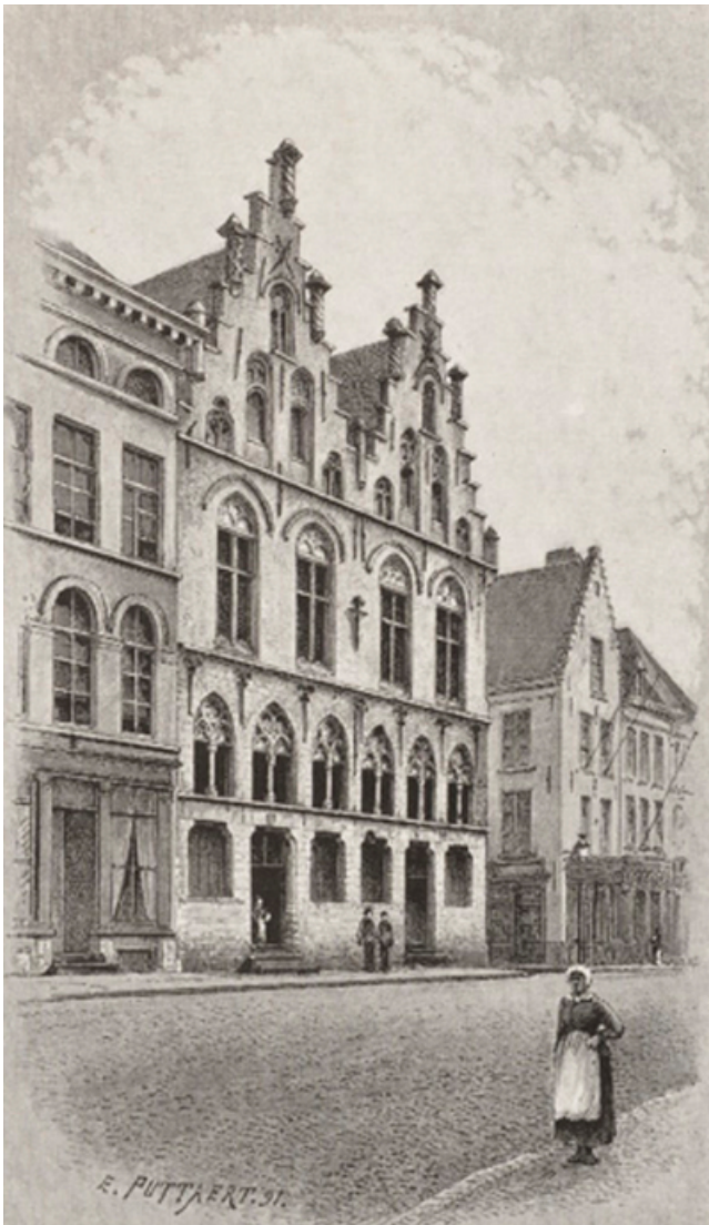
View of the Butchers's Hall where the Urban Museum was located on the 1st floor until WWI. E. Puttaert (draughtsman) and Jean Malvaux (engraver), Musée et Halle aux viandes, circa 1879 (SM 001551).

It is probably no surprise to read that WWI not only left the city in ruins, but also destroyed much of its cultural patrimony. The collection of the Urban Museum, housed on the top floor of the Butchers' Hall, was also almost completely destroyed. Only the pieces that hung in the Town Hall, including the stationary portraits, survive the violence of war. They are today part of the Yper Museum's collection. The collection of the houses of worship and the Mergehlynck Museum were (partially) saved, however. The Merghelynck collection could be admired from May 1915 in the exhibition of saved art from the Belgian front region in the Salle flamande in the Petit Palais in Paris.[i] After the war, these collections returned to Ypres, often with a diversion.